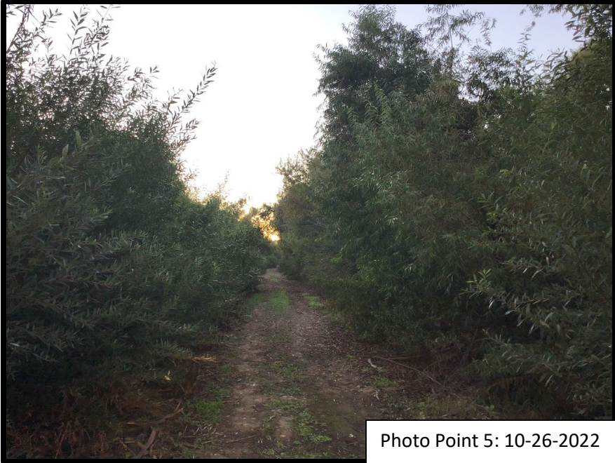
Photo Point 5: 10-26-2022