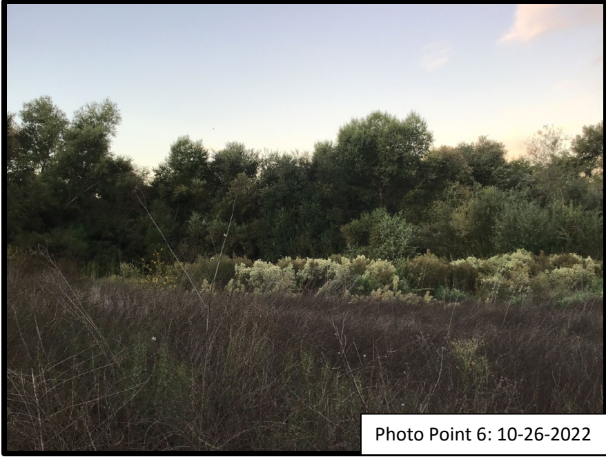
Photo Point 6: 10-26-2022