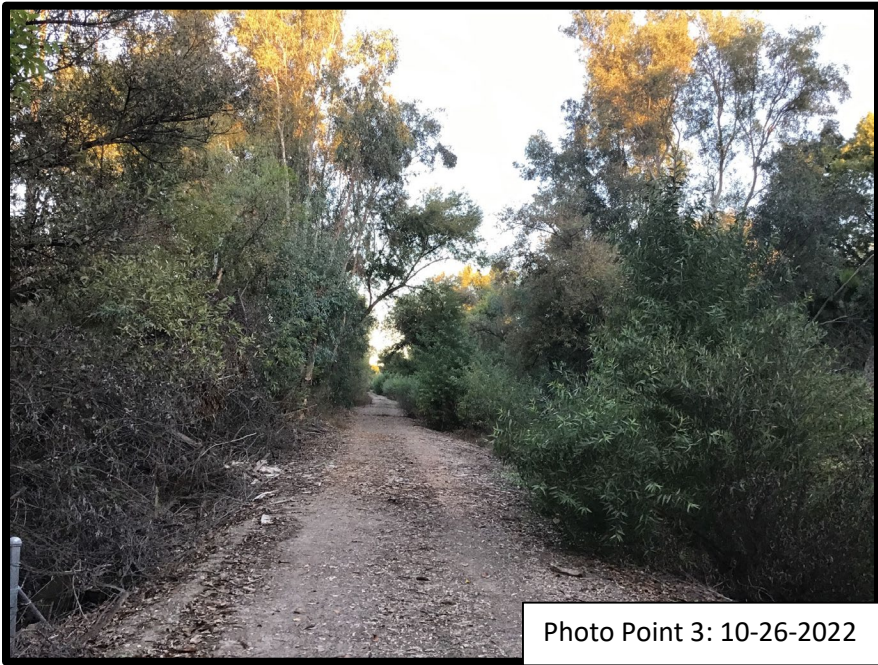
Photo Point 3: 10-26-2022