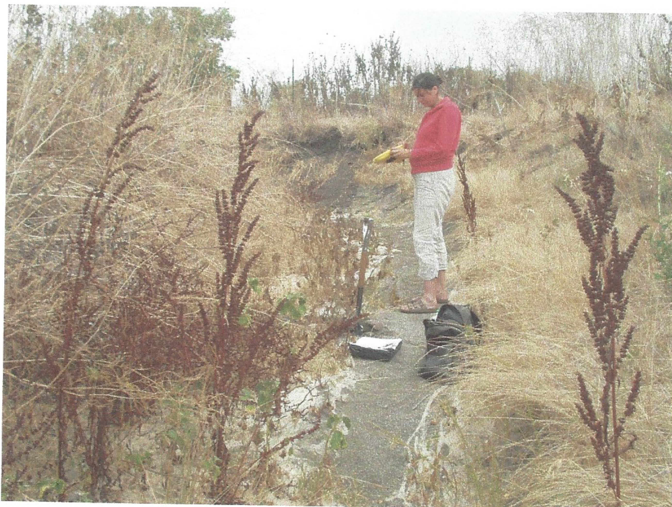
West Branch Llagas Creek, Martin Property