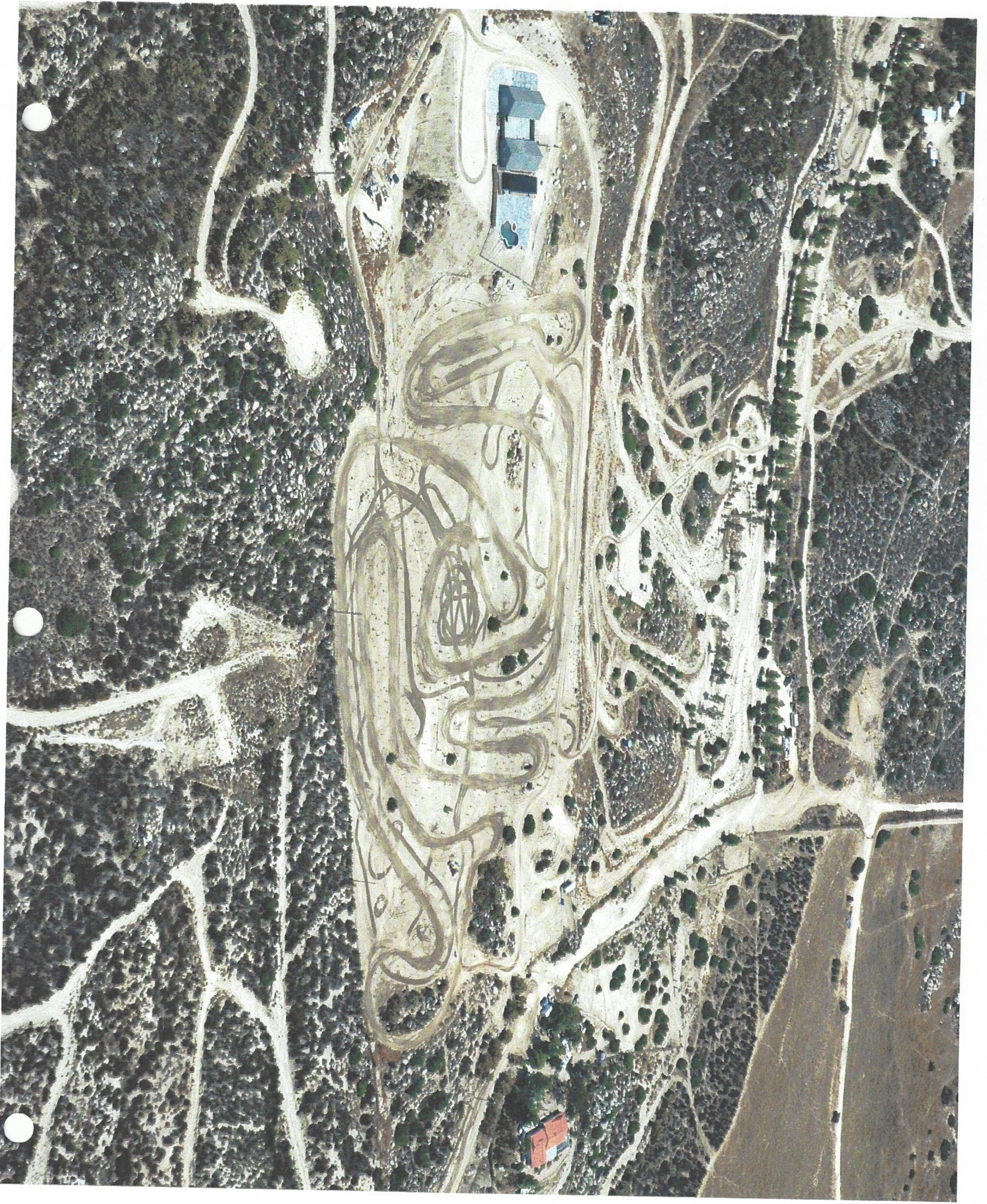
MARK PRESCOTT TRACK