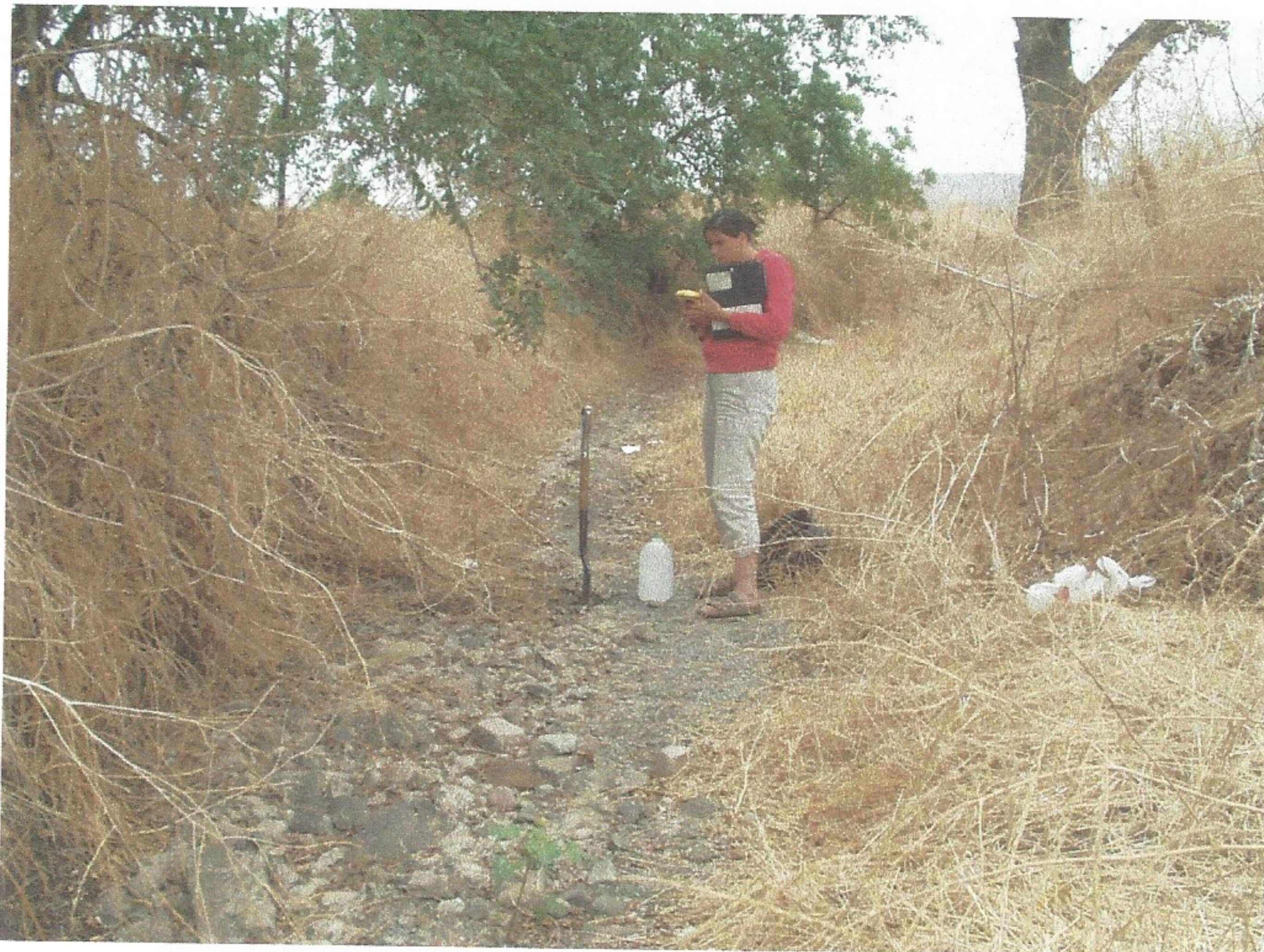
West Branch Llagas Creek, Martin Property