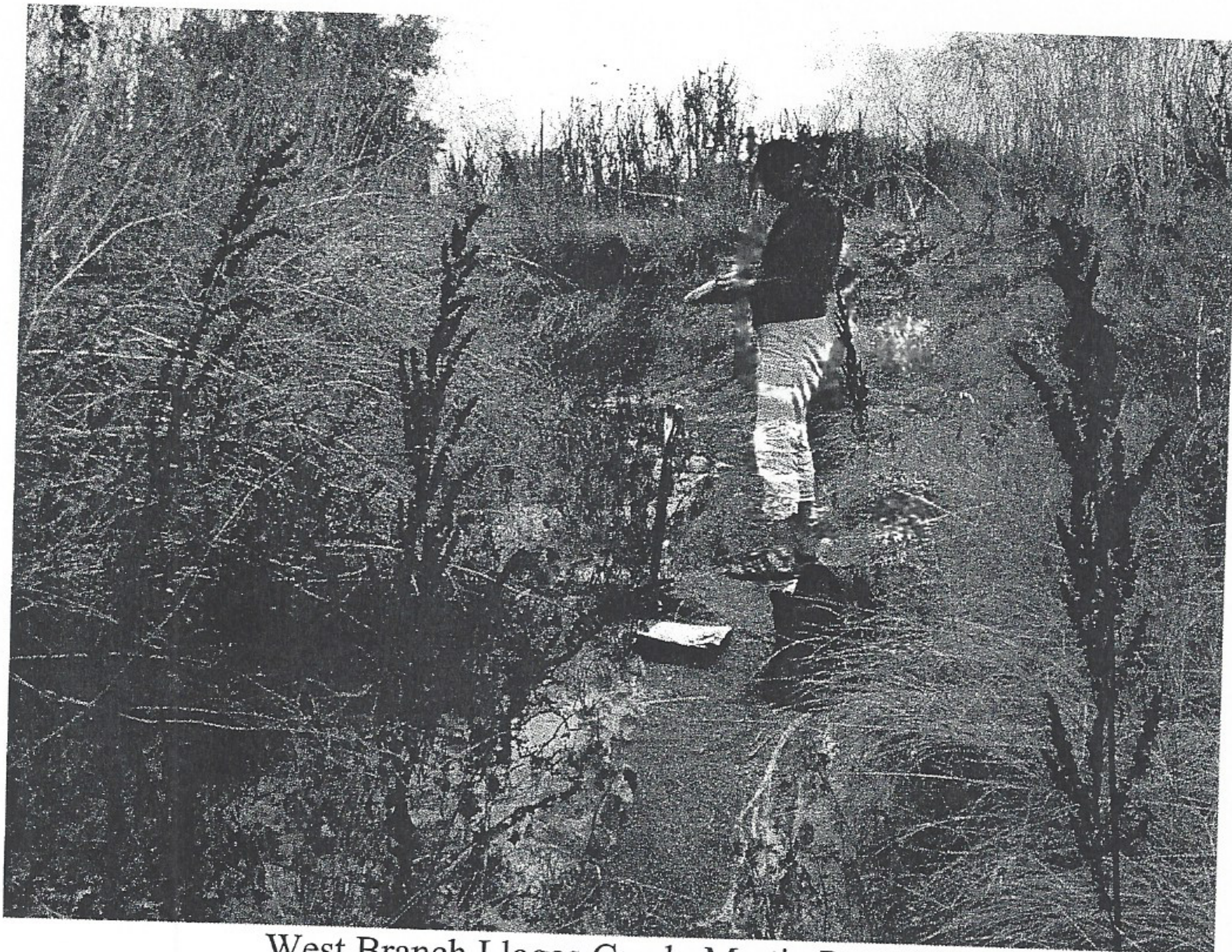
West Branch Llagas Creek, Martin Property