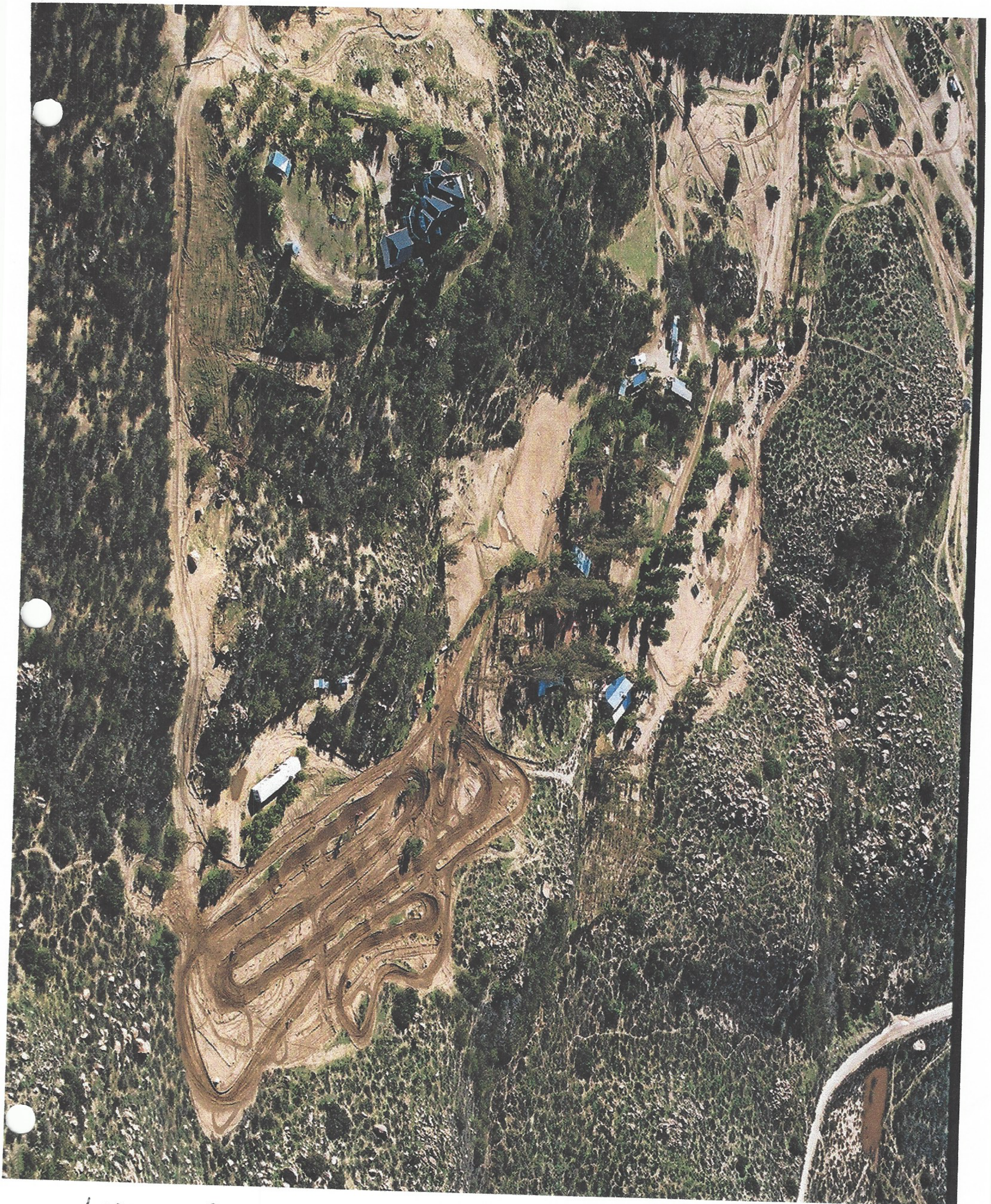
KEN ALLEN TRACK